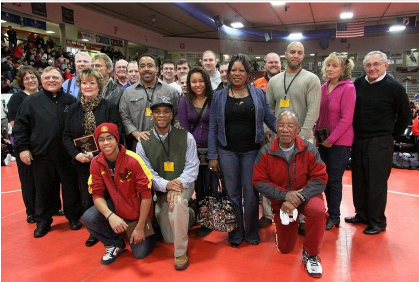
2011 Battle of Waterloo Hall of Fame Inductees